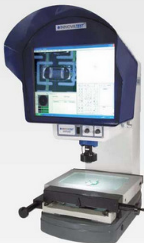
DVP500B DIGITAL VIDEO PROJECTOR