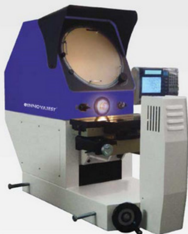
INH30A HORIZONTAL PROFILE PROJECTOR