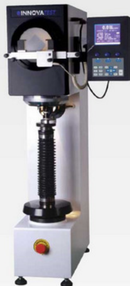
NEXUS 7000 1KGF TO 250KGF