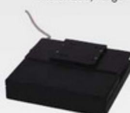
INV3 & INV4