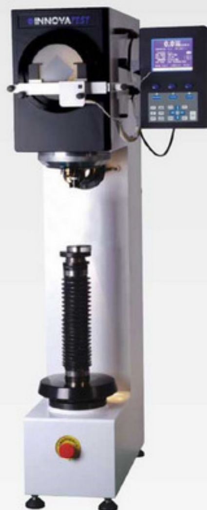
NEXUS 7000 XL 1KGF TO 250KGF