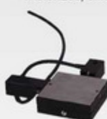
INV3 & INV4